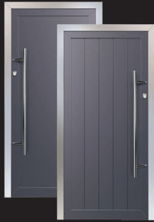
SOLID / SHIPLAP